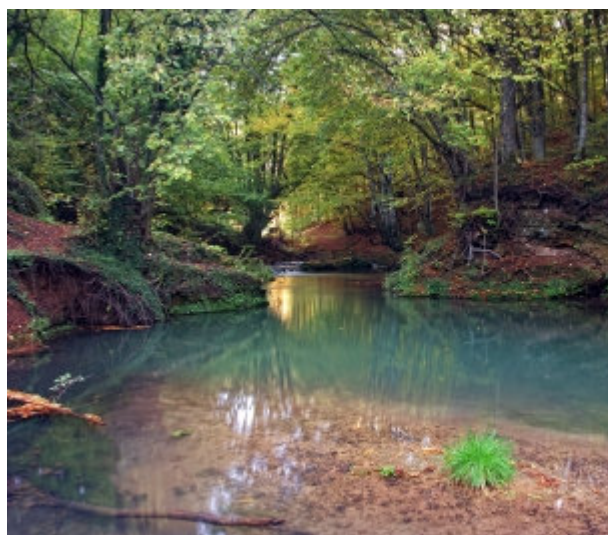
"Forest Eden" by prozac1